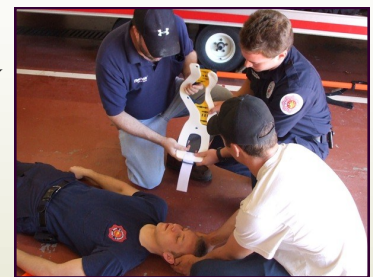
CERT Members in training.